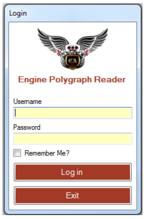
Figure 3 (Left): Panel displayed to initiate your session on your device.

The Install Wizard will place an icon on your PC desktop. Double-click on the icon to open the Login screen: